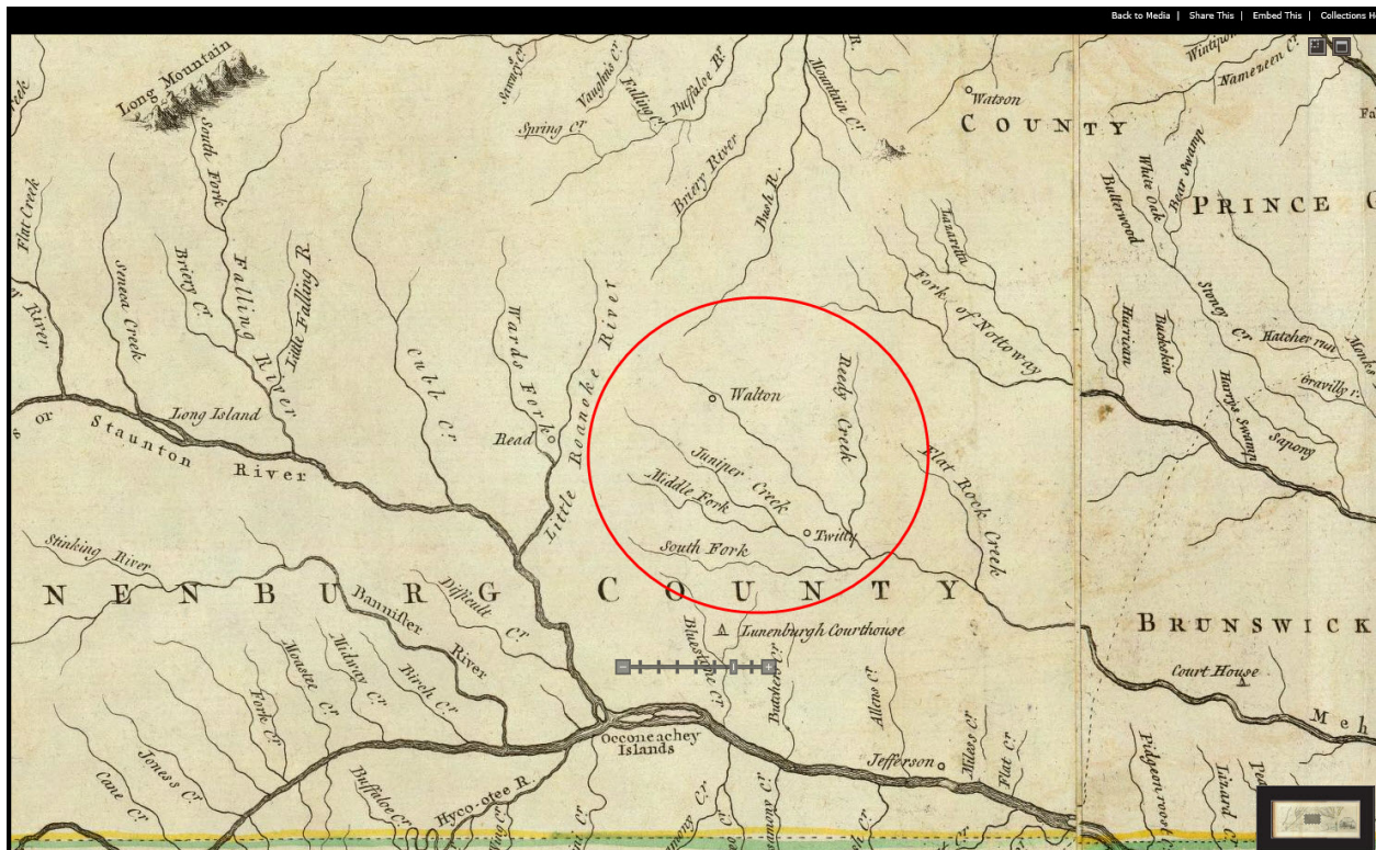
Map 3 Reedy Creek Area, Lunenburg County, Va. 36