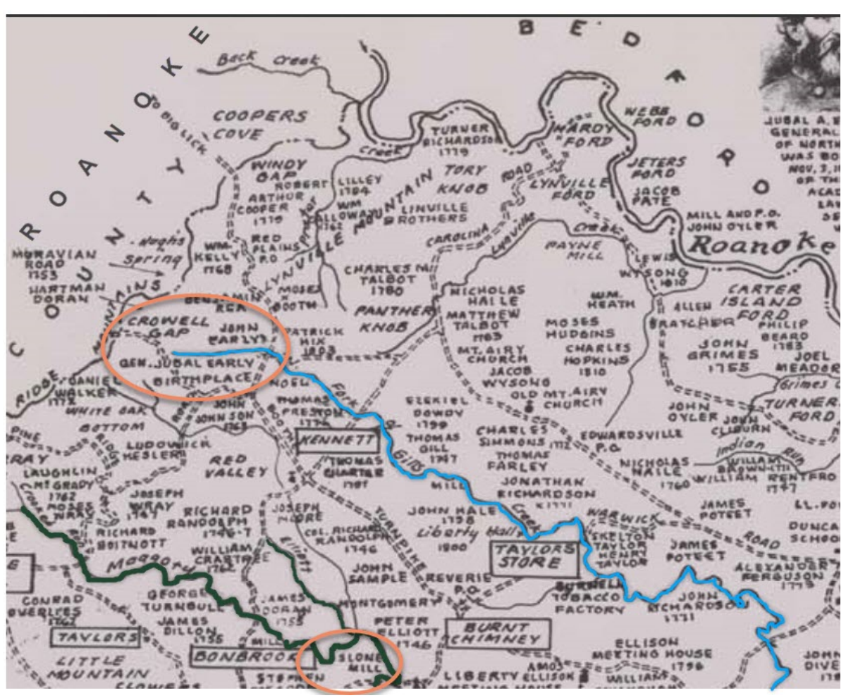
Map 1 Maggoty Creek & Gills Creek, Northwest & North-Central Franklin County<sup>30</sup>